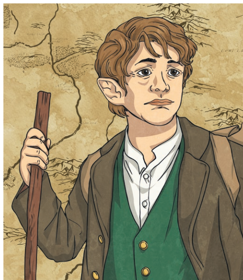
Bilbo Baggins 6