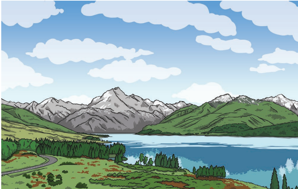
The Lonely Mountain 7

Now that Mr Baggins has recovered from his epic adventure, he says he has asked the police to make the Sackvilles hand back his property. He will be staying at Bag End for the foreseeable future: "No more adventures for me!" said Bilbo, grinning. 10