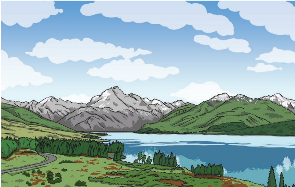
The Lonely Mountain

Now that Mr Baggins has recovered from his epic adventure, he says he has asked the police to make the Sackvilles hand back his property. He will be staying at Bag End for the foreseeable future: “No more adventures for me!” said Bilbo, grinning.