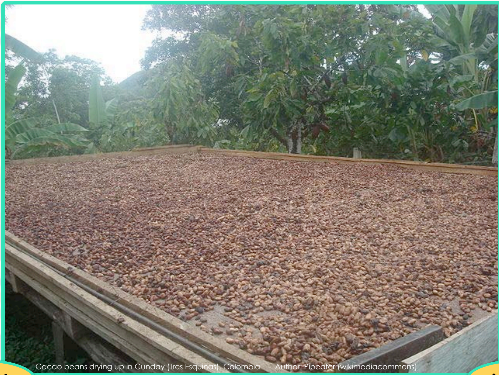
Cacao beans drying up in Cunday (Tres Esquinas), Colombia

Some parts of South America also grow, harvest and export cacao beans. It is these beans which make chocolate!