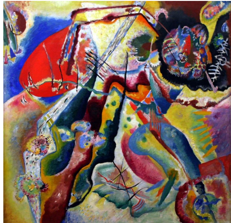
Abstract Painting by Wassily Kandinsky

Wassily Kandinsky was a Russian painter. Many people think he was the first abstract artist.