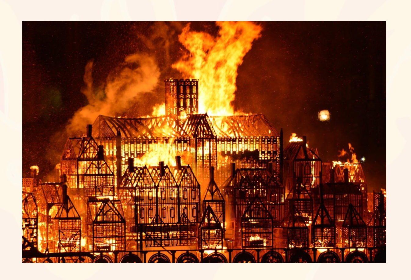
Lesson 1 Now Press Play – The Great Fire of London