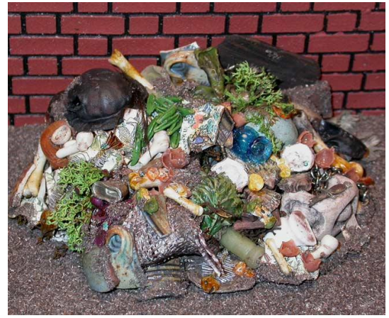
Rubbish in the streets