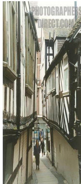
Close houses and small streets