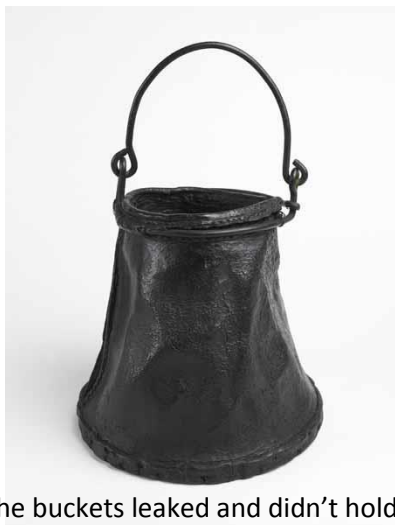
The buckets leaked and didn't hold much water