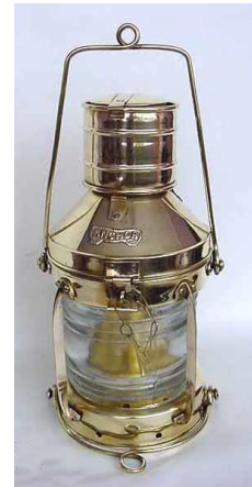
Oil was used in lamps