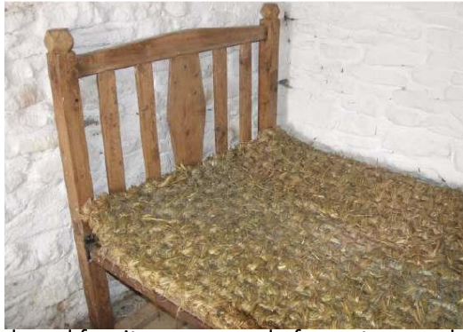
Beds and furniture was made from straw and wood