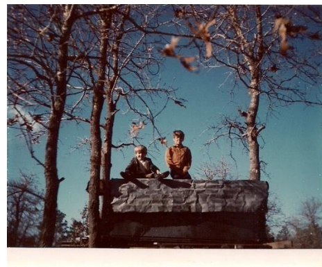
People jumped on rooftops to escape