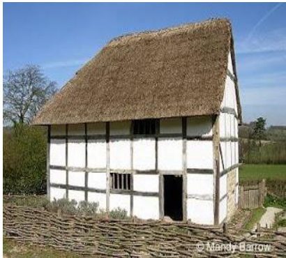
Houses made from wood and straw