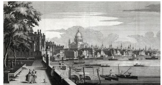
Houses close to the river