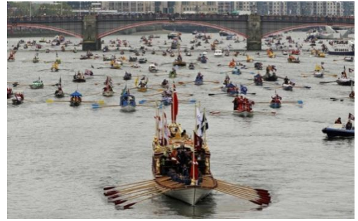
Lots of boats were used