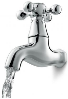
No running water