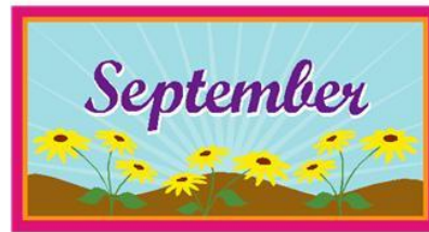
It was September