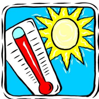
Hot summer and dry houses