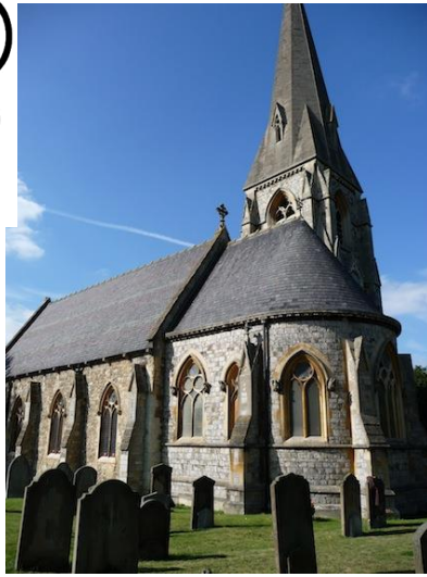
Churches were made from stone and brick