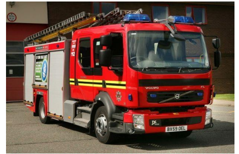
No fire brigade