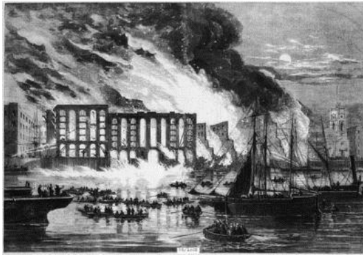
Lots of warehouses stored oil, candles and coal