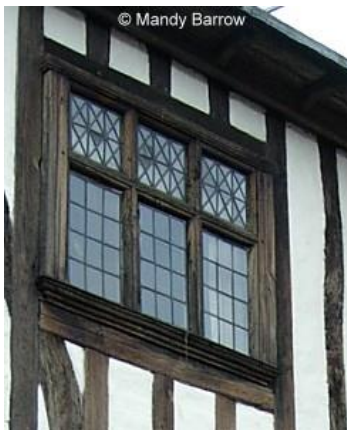
Metal (lead) was used in the buildings